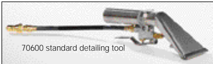
70600 standard detailing tool