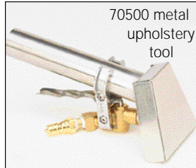
70500 metal upholstery tool