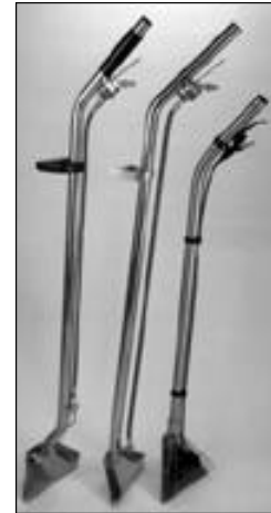
80100 / 80250 / 596