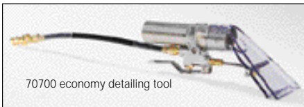
70700 economy detailing tool