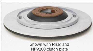
Shown with Riser and NP9200 clutch plate

786754 - 14" 786755 - 15" 786756 - 16" 786757 - 17" 786758 - 18" 786759 - 19" 786760 - 20"