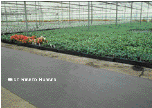
WIDE RIBBED RUBBER