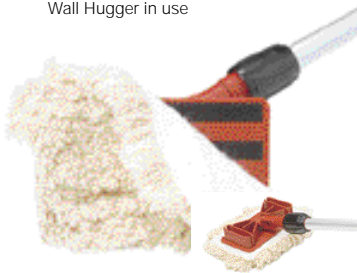
Wall Hugger in use