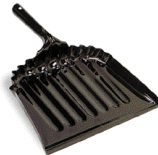
715 - 12" metal dustpan