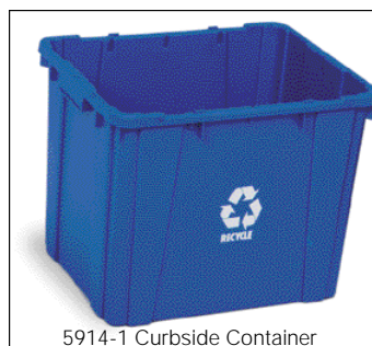
5914-1 Curbside Container