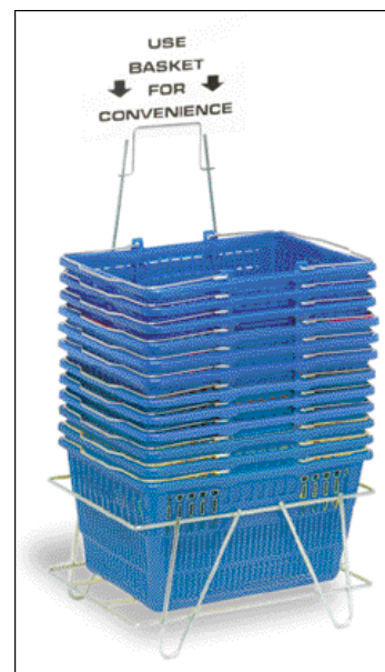
Photo: shows 413 Wire Rack and Signs with 412 totes *412 totes ordered separately

* order PN#413 (baskets sold separately)