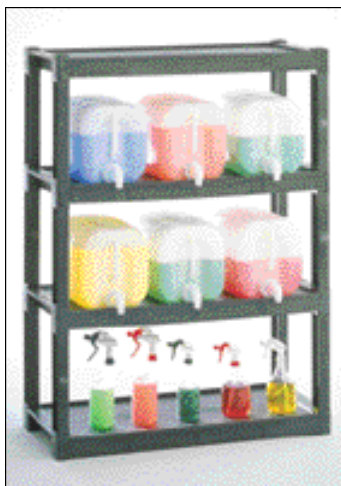
7204 structural plastic shelf