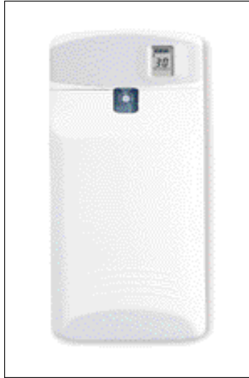
AutoFresh LCD Pump Dispenser

Preference Pack • offers 5 premium fragrances (2 of each) • fragrance variety in Preference Pack prevents "fragrance fatigue"