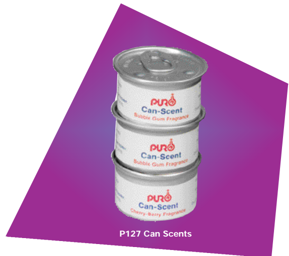
P127 Can Scents