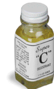
151 Super C