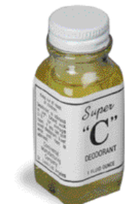
151 Super C