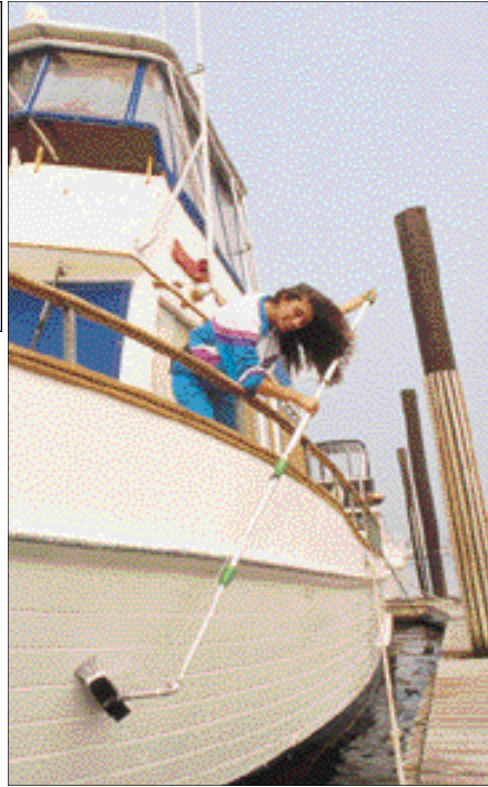
USE TO REACH DIFFICULT ANGLES