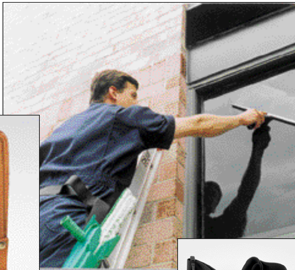
The Belt and Bucket-on-a-Belt in use