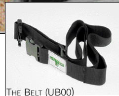
THE BELT (UB00)