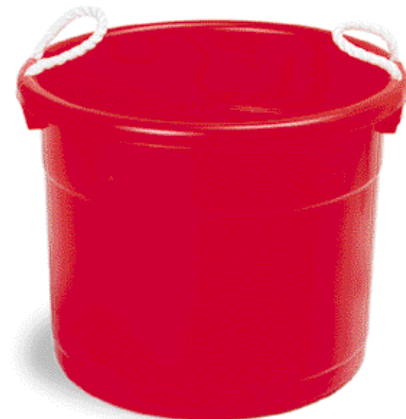
8119 HUSKEE hauler