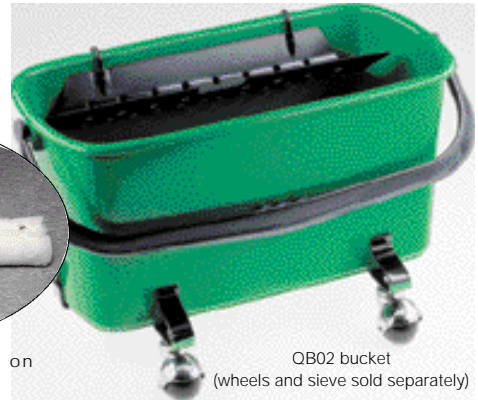
QB02 bucket (wheels and sieve sold separately)