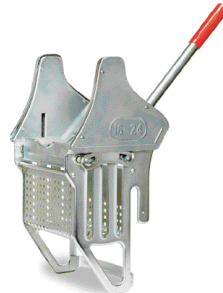
CM1624 - 16-24 oz. downward pressure