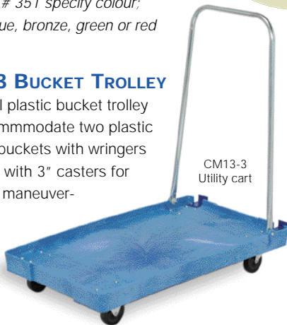
CM13-3 Utility cart

Choose from our fine selection of mopsticks on page 67