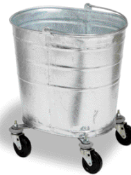
C26-3 -oval 26qt bucket w/3" casters