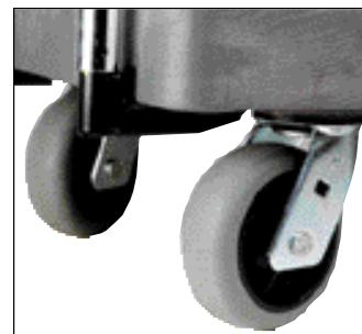
Casters are NSF listed and are chemical resistant

See current price list for product specifications. Contact your customer service representative for availability.