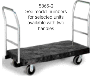
5865-2 See model numbers for selected units available with two handles