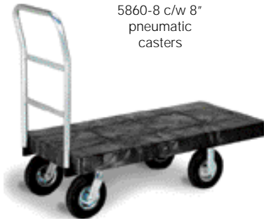
5860-8 c/w 8" pneumatic casters