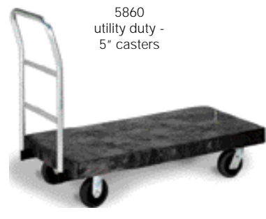
5860 utility duty - 5" casters