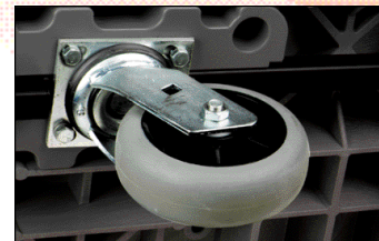
Nested steel support will not scratch or dent walls, furniture

CHOOSE THE PLATFORM TRUCK THAT FILLS YOUR REQUIREMENTS