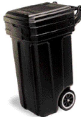
5850 tilt n wheel